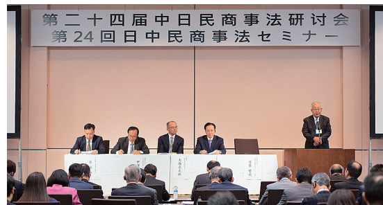
Held in November 2019 (Tokyo)

Every year since its establishment in 1996, the Foundation has held seminars alternately in Japan and China. These seminars are a way of enhancing our understanding of China with particular reference to the complementary fields of civil and commercial law. As well as providing participants with up-to-the-minute information from Chinese experts on prevailing trends related to China's legal system, this also gives Chinese attendees the opportunity to learn about Japan's legal system.